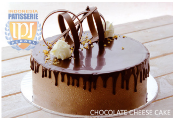
5. Chocolate Truffle Cake