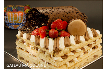
4. Gateau Marjolaine