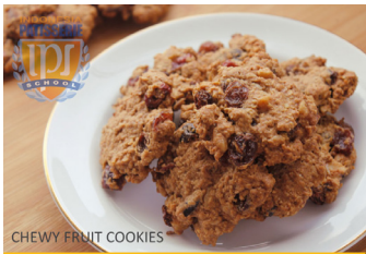
CHEWY FRUIT COOKIES