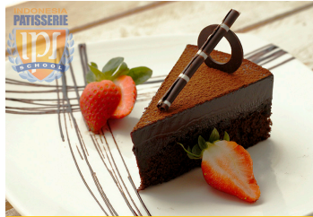
2. Chocolate Mud Cake