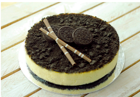
1. Cookies & Cream Cheese Cake