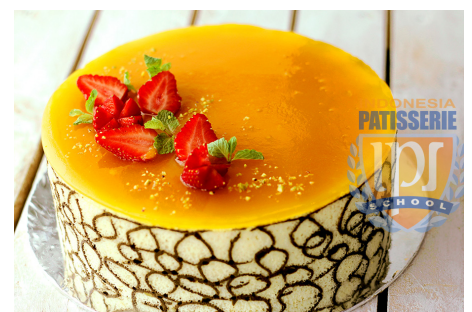
1. Passion Fruit Torte