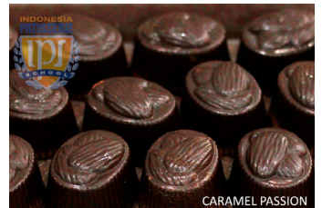
2. Caramel Passion