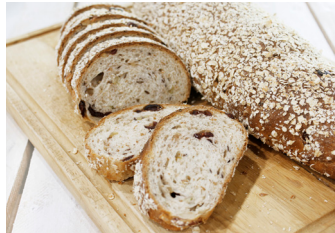
2. Healthy Fruit Bread