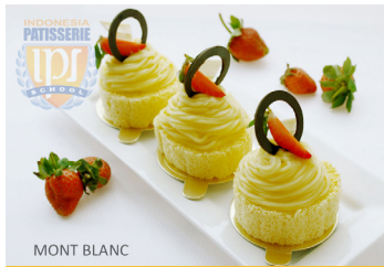
3. Mont Blanc