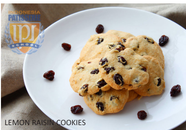
1. Lemon Raisin Oat Cookies