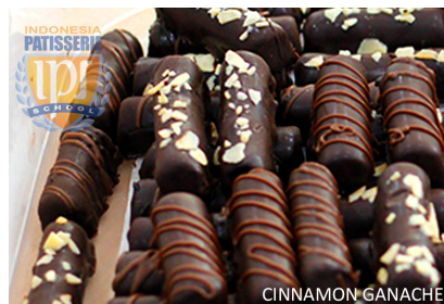
2. Cinnamon Ganache