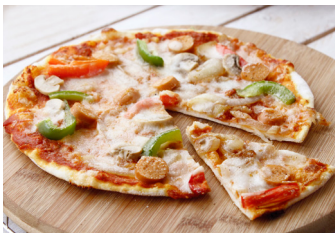
1. Italian Pizza