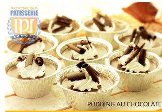
1. Chocolate Pudding