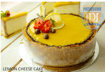
1. Lemon Cheese Cake