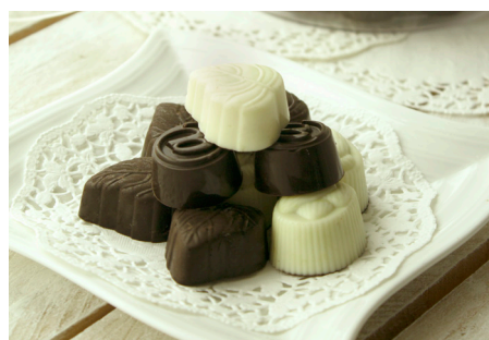
2. Coffee Praline