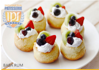
2. Baba Rum