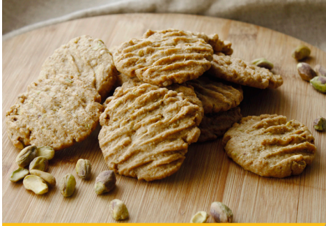
1. White Chocolate Oatmeal Pistachio Cookies