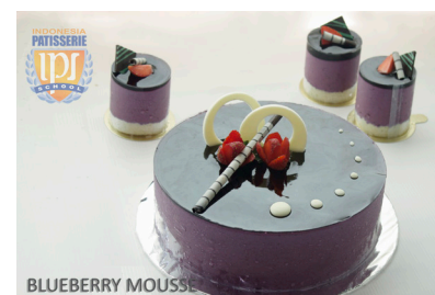
1. Blueberry Mousse