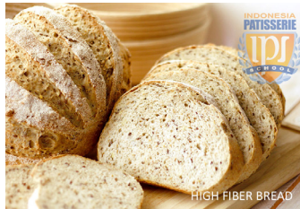
HIGH FIBER BREAD