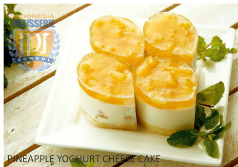
2. Pineapple Yoghurt Cheese Cake