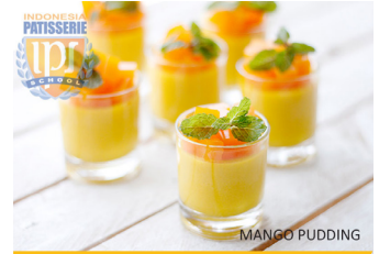
2. Mango Pudding