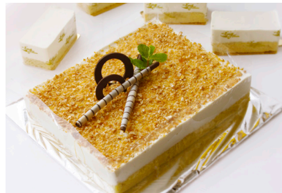
2. Beancurd Cheese Cake