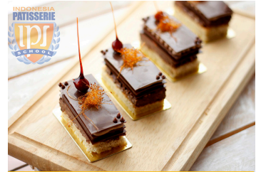
4. Sweet Pleasure