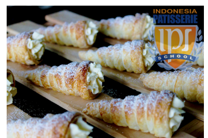
3. Cream Horn