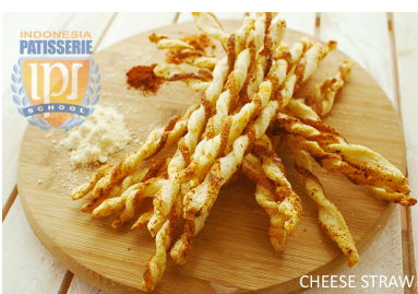
1. Cheese Straw