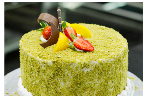
3. Matcha Cheese Cake