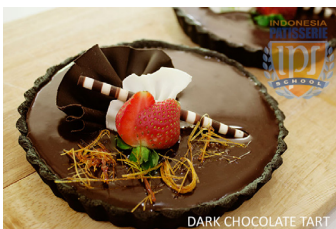
1. Dark Chocolate Caramel Tart