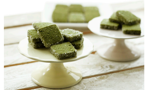
3. Green Tea Cookies