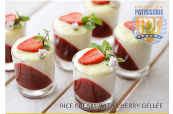
RICE CREAM WITH CHERRY GELEE