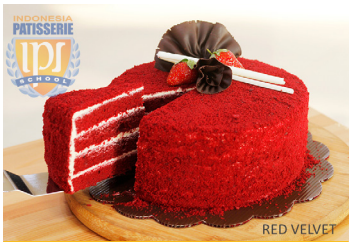
1. Red Velvet Cake