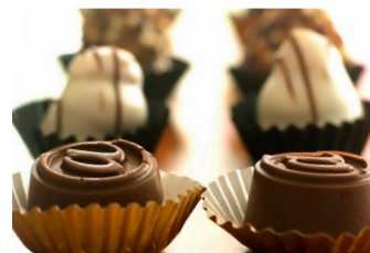
1. Passion Fruit Praline