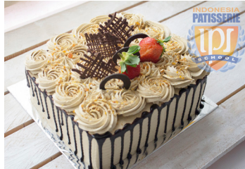
2. Mocha Cake