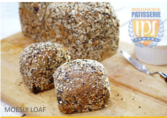
1. Moesly Loaf