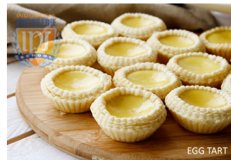
1. Hongkong Egg Tart