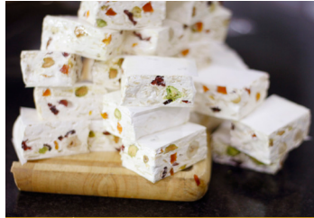
2. Green Tea Gateau