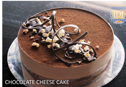
2. Chocolate Cheese Cake