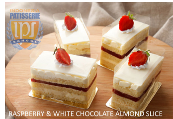
3. Raspberry & White Chocolate Almond Slice