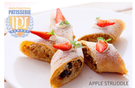
3. Apple Strudel