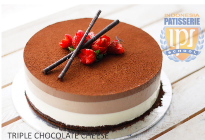
1. Triple Chocolate Cheese Cake