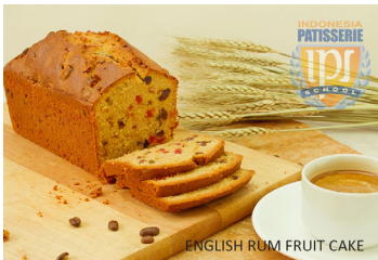
1. English Rum Fruit Cake