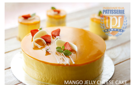
3. Mango Jelly Cheese Cake