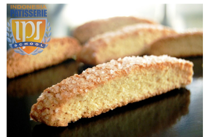
3. Vanilla Biscotti