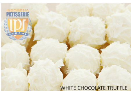
1. White Chocolate Truffle