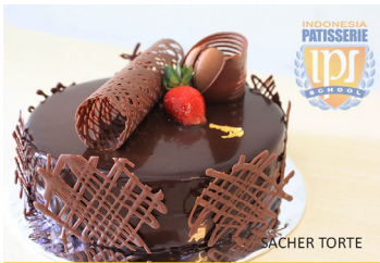
1. Sacher Torte