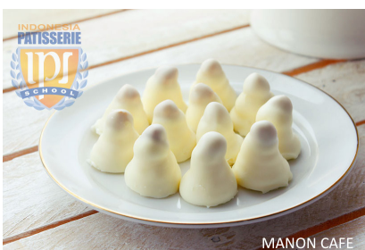
1. Manons Cafe