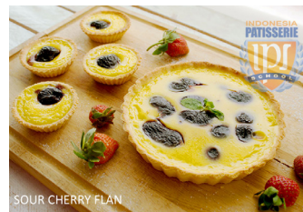
SOUR CHERRY FLAN